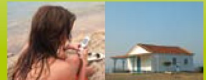
... or in your holiday home