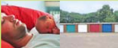
inside your storage unit