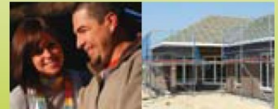
for your house under construction